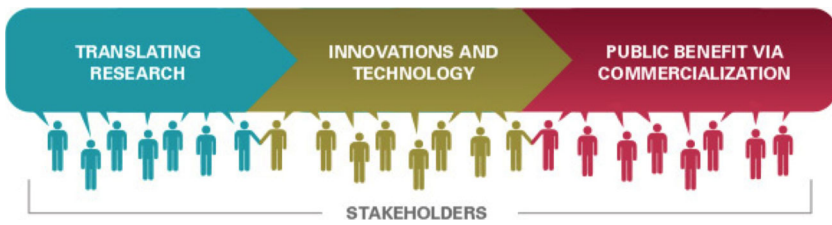
Figure 2. Interconnectedness of stakeholder interests.

and increases prospects of attracting funding. 122 Government will provide public funding for basic research so long as the funds go toward supporting research that have the potential to drive economic growth and address societal challenges. 123 Socioeconomic growth sought by government will only be realized if industry can successfully commercialize basic research (ie create jobs, generate tax revenue, and introduce innovations to the market to improve social welfare). Industry will also provide funds to support basic research if there is an incentive to invest, such as through intellectual property and commercialization policies that contemplates revenue sharing. The interconnectedness of stakeholder interests is almost like a chain reaction—one needs to happen in order for the next to follow (see Figure 2).