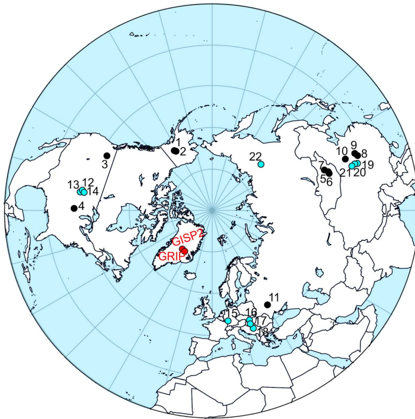
Figure 1. Location of ice cores in Greenland and potential source area (PSA) samples around the Northern Hemisphere. Black dots denote PSAs analyzed by Biscaye et al. [1997] and Svensson et al. [2000]: 1 and 2. Moose Mountains, AK, U.S.; 3. Pullman, WA, U.S.; 4. Pancake Hollow, IL, U.S.; 5–7. Gobi desert; 8. Weinan, China; 9. Luochuan, China; 10. Yulin, China; and 11. Muzichi, Kijev, Ukraine. Blue dots denote PSA samples analyzed in this study: 12. Judkins, NE, U.S.; 13. Prairie Lake, NE, U.S.; 14. Obert, NE, U.S.; 15. Nussloch, Germany; 16. Mende, Hungary; 17. Dunaszekcső, Hungary; 18. Titel, Serbia; 19. Lingtai, China; 20. Xifeng, China; 21. Beigoyuan, China; and 22. Tumara Valley, NE-Siberia, Russia.

to be >1 – 2 [Scheuvsens et al. , 2013], whereas in a boreal climate it is <0.5 – 1 [Griffin et al. , 1968]. Beyond latitude-indicating species, any source area has a characteristic spectrum of clay minerals, partly reflecting local lithology and climate and drainage characteristics. Source area discrimination is therefore a matter of comparing relative abundances of an entire suite of minerals, some of which may be diagnostic, while others are conversely too common across possible source areas and thus noncharacteristic [Biscaye et al. , 1997].